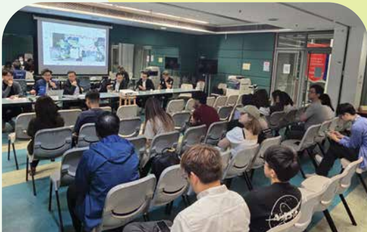
Forum with residents of Jockey Club Student Village II on 8 May 2025