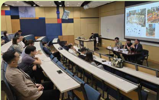
Meeting with residents of University Heights on 20 May 2025

HKU engages proactively with community stakeholders through various channels such as meetings and presentations to share updates on Pokfield Road Campus Development, simultaneously gathering community opinions and liaising with the project team.