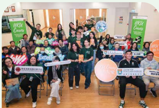
Students from diverse disciplines united by their passion for community service.