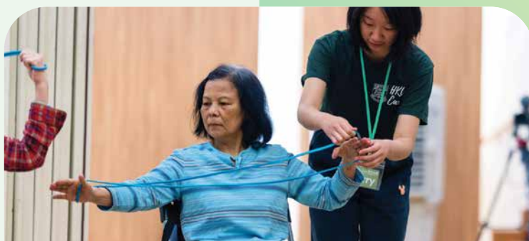
Elderly Exercise Class + Community Fun Day