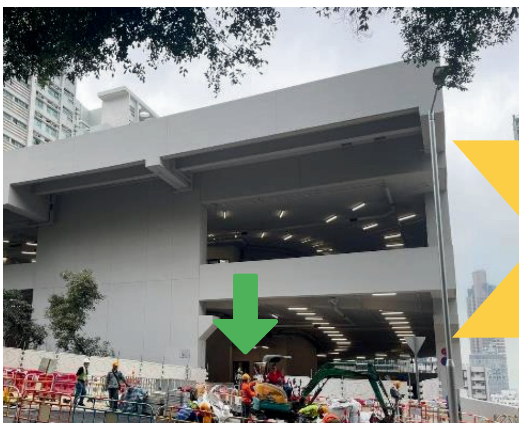
Pok Fu Lam Road Access

Vehicular and pedestrian access to JCSVII (Morrison Hall, Suen Chi Sun Hall, Lee Shau Kee Hall) from Pok Fu Lam Road will be re-routed via the new Drum Ramp Building . The existing access road will be closed and become a part of the construction site.